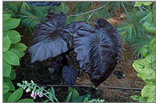
Royal Hawaiian Black Coral Elephant Ear